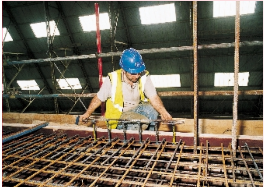
Figure 1: Fixing prefabricated shear reinforcement at Cardington

This Guide provides recommendations for the use of prefabricated punching shear reinforcement systems, and the associated design approaches.