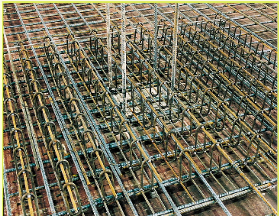
Figure 4: Shear ladders used for an internal column. The top reinforcement is yet to be fixed