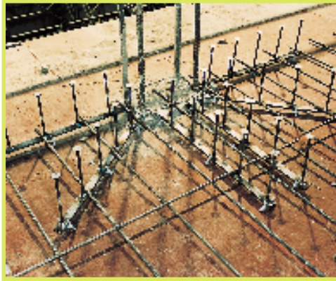
Figure 2: Stud rails arranged radially around an edge column

Two makes of stud rail were used at Cardington. The first, DEHA stud rails (Figure 2), had the spacing bar at the bottom and were fixed in position before placing the main reinforcement, although they can also be fixed from above. The second, known as AncoPLUS shear studs, were fixed from the top after all the main reinforcement had been positioned (see Figure 1). Other manufactured stud rail systems include the Halfen HDB-A system.