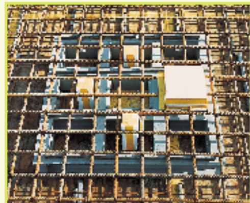
Figure 6: Structural steel shearhead allows the formation of openings immediately adjacent to an internal column