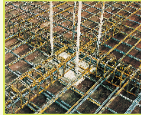
Figure 3: ACI shear stirrups arrangement for an internal column. The top reinforcement is yet to be fixed